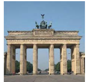
BRANDENBURG GATE IN BERLIN

In April of 1944, the Jewish leaders recognizing, they and their community were about to be exterminated en masse , didn't stop some of the young adults who led an uprising from the ghetto. This uprising was followed in August of 1944 by an uprising on the part of the general population of the city. Over many months, the citizens of Warsaw fought back and fought hard. There were even a few brief periods when it appeared they had a chance of prevailing. But that was not to be.