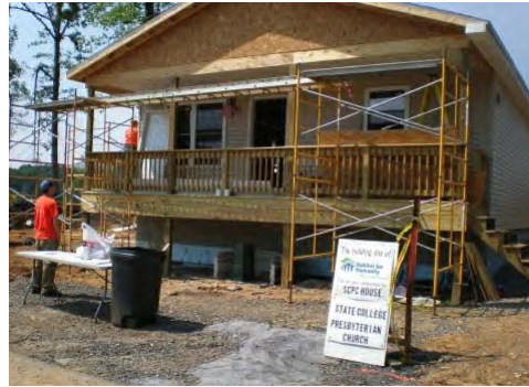
From 7/10/8. windows in, siding going up, rough wiring done.

and small!) and a special House Sing concert to provide all the materials needed for the house. Every week (W thru Sat) from mid