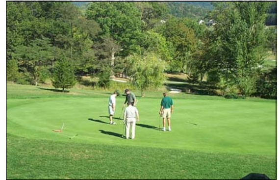
Golfers enjoyed a beautiful day at Presbyterian Homes' First Annual Golf Outing last year.

The cost is $100 per golfer or $400 per foursome. Businesses may display their names on one of the tee or green signs that day for $250 and